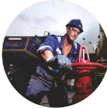
OIL & GAS INDUSTRY PERSONNEL