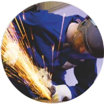
ELECTRO-MECHANICAL AND FABRICATION PERSONNEL