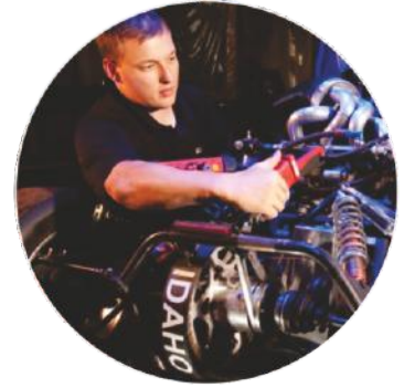
MECHANICAL INDUSTRY PERSONNEL