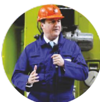
POWER GENERATION PERSONNEL