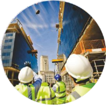
CONSTRUCTION AND CIVIL WORKERS