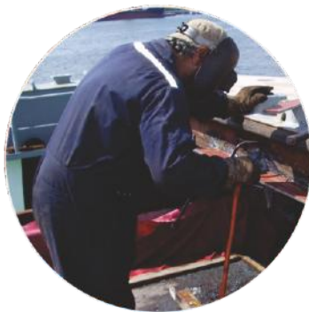
SHIP REPAIRS AND MAINTENANCE PERSONNEL