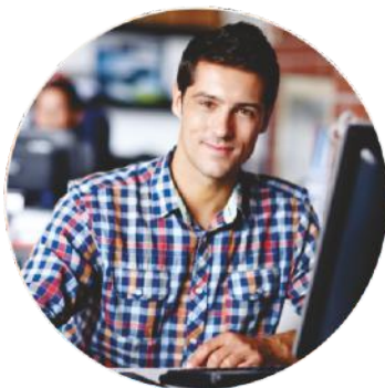
SOFTWARE ENGINEERS AND IT PROFESSIONALS