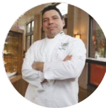
BAKERY AND CONFECTIONARY PERSONNEL