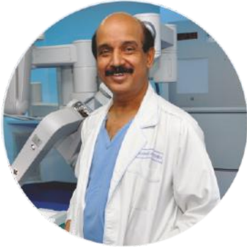
HOSPITAL AND HEALTH CARE PERSONNEL