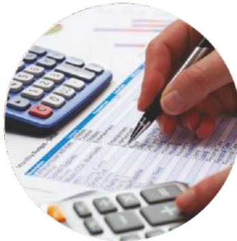
FINANCE AND ACCOUNTANCY PERSONNEL