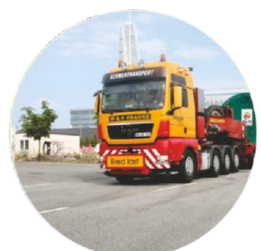
TRANSPORT AND HEAVY EQUIPMENT INDUSTRY PERSONNEL