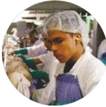
PROCESSING PLANTS PERSONNEL